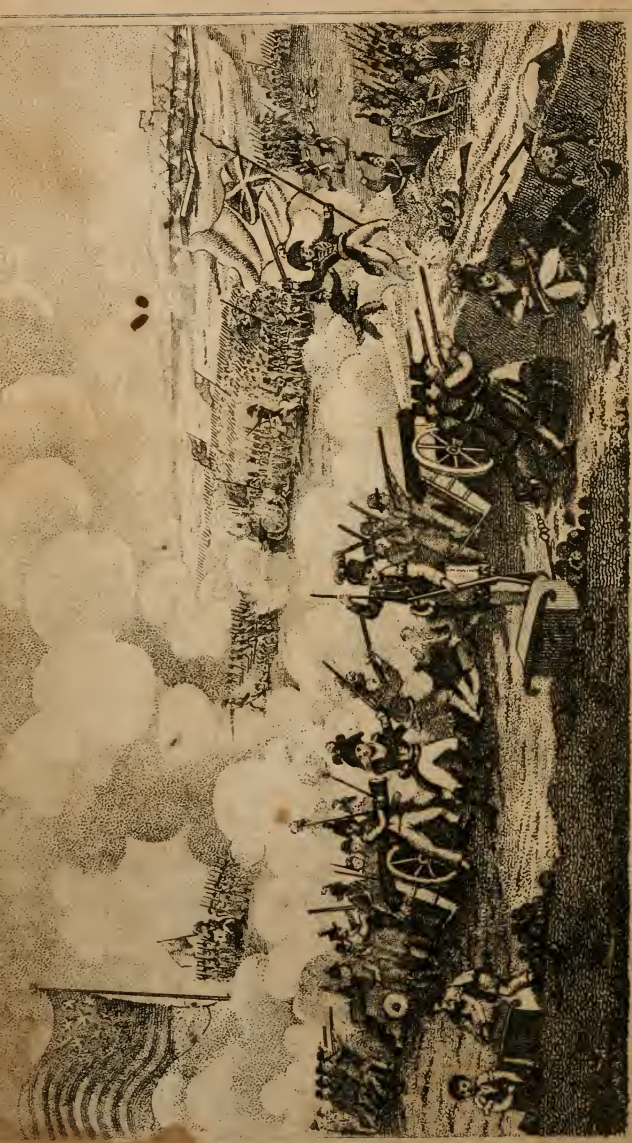
JACKSON'S ENGAGEMENT with the British at NEW ORLEANS.